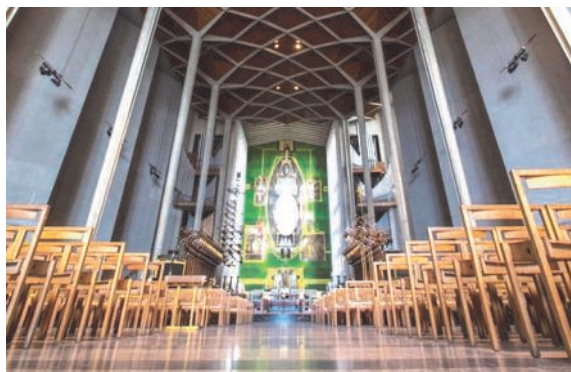
An empty Coventry Cathedral.

As I shut down the organ at Saint Peter's on Sunday morning, I realised I had no idea when the music would sound out again with church closures and curfews during the present health emergency. However, music can be accessed via the internet, radio, streaming services and CDs so all is not lost during these testing times.