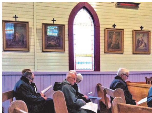
The Vicar and early arrivals waiting for the Service to begin.