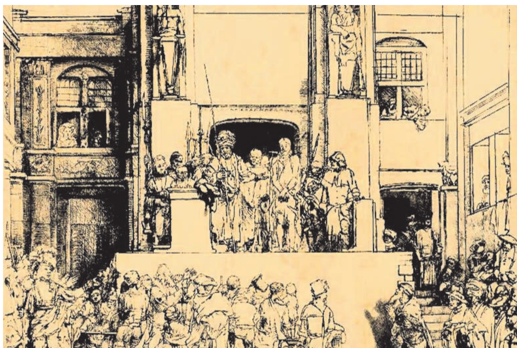
Rembrandt’s Ecce Homo , a 1655 print considered among the artist’s most significant achievements