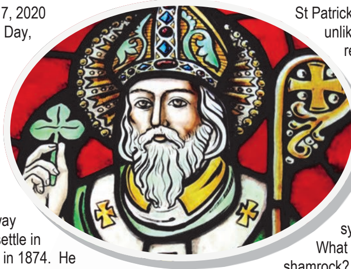
St Patrick with shamrock.

The missionary endeavours of St Patrick conflicted with the Druids, the practitioners of Celtic religion. The traditional belief that