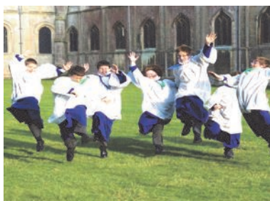
'It's NOT ALL SERIOUS' – CHORISTERS OF ELY CATHEDRAL.

Theodulph of Orleans, imprisoned in the dungeons of Angers, France,